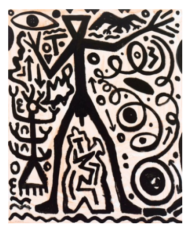
A.R. Penck Tiger in the Jungle at Night (2011)